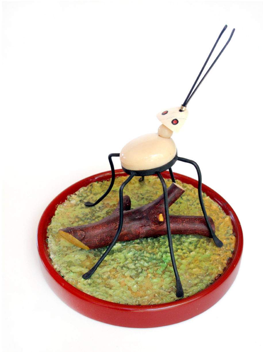
Garry Knox Bennett Roach Clip, Untitled, 2014 6 X 6 X 8"