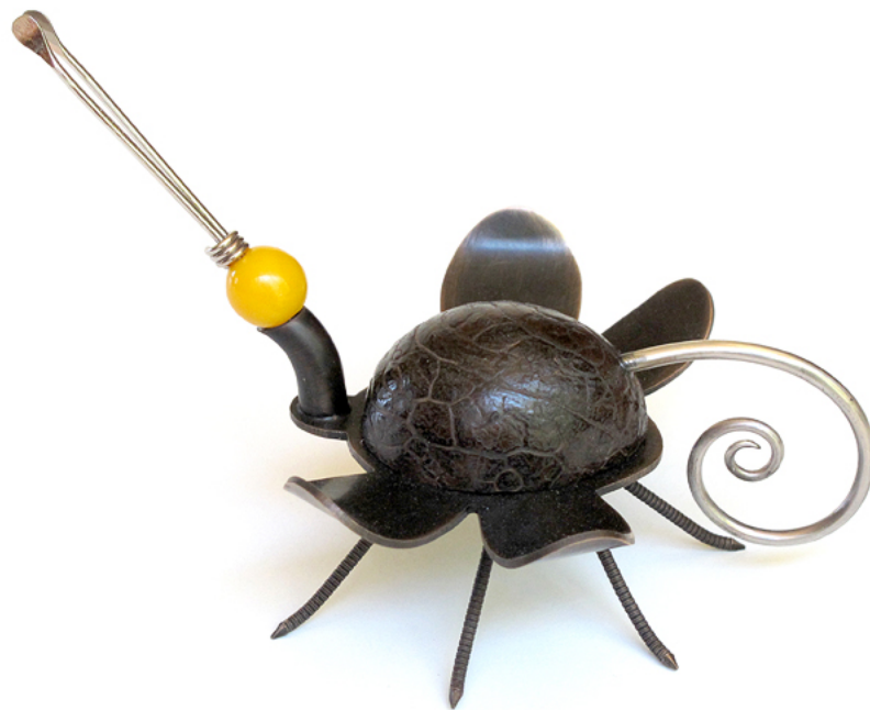
Garry Knox Bennett Roach Clip, Dung Beetle (without stand), 2014 4 X 6 X 4"