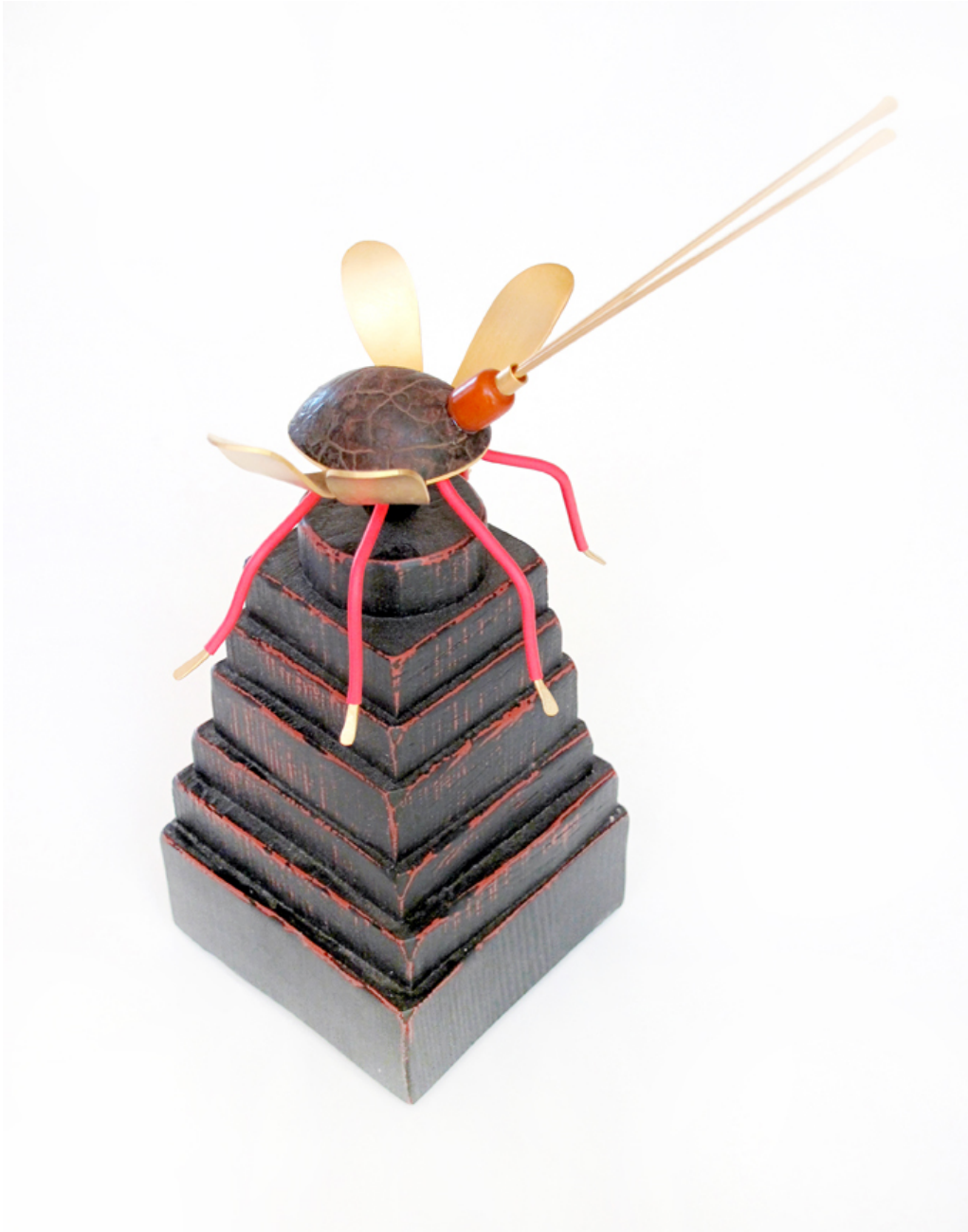
Garry Knox Bennett Roach Clip, Untitled, 2014 5 X 9 X 9"