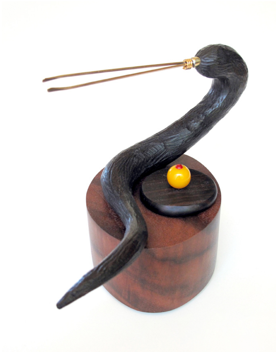
Garry Knox Bennett Roach Clip, Snake with Box, 2014 8 X 4 1/2 X 5"