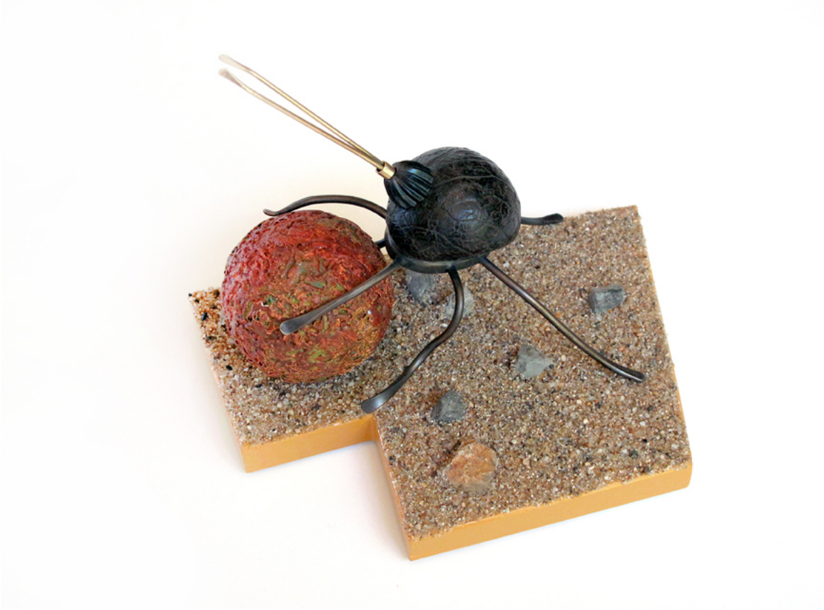
Garry Knox Bennett Roach Clip, Dung Beetle (with stand) , 2014 5 X 7 X 5" with stand